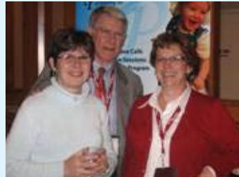
Education event attendees