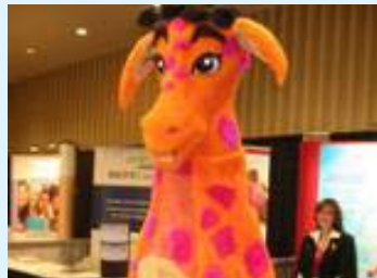
Gerri the Giraffe , Ottawa Public Health, Ontario